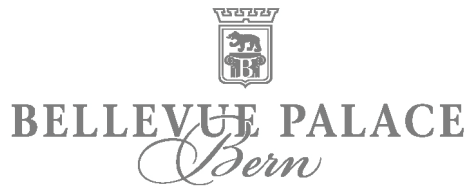
EXHIBIT A: FIT (INDIVIDUAL) RATES / VALID JAN 1 - DEC 31 2019